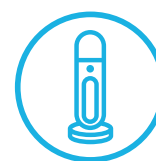
LEICA BLK2GO HAND HELD LASER SCANNER LASER