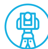
LEICA RTC360 LASER SCANNER