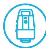
TOTAL STATION (LEICA TS 15)

Your Favourite Tools: Total Station (favourite), prisms, GPS, calculator, tape measure, compass, laptop