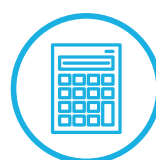
CALCULATOR (HP 50G)