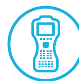
GPS (TRIMBLE R10)